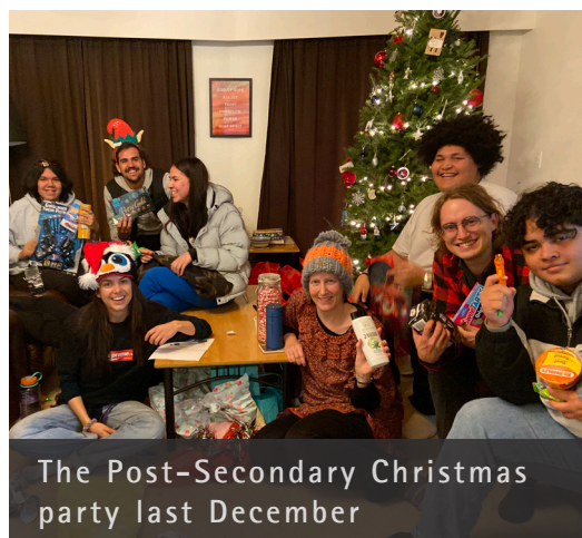
The Post-Secondary Christmas party last December

Thank you for making all of this possible!