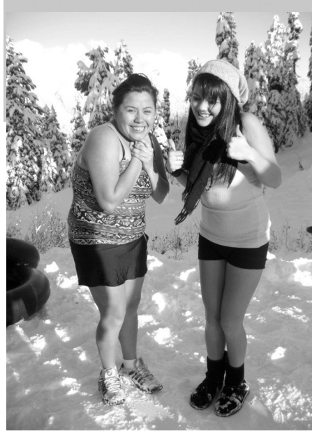
getting ready to take the tubes down the hill in swimsuits!