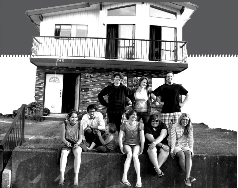
L: group picture outside “The House,” June 2012

Walking alongside at-risk youth; empowering them to live healthy lives.