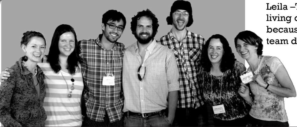
L: a reunion of Youth Extremers from the early years gathered at Trinity Western on May 6

To raise the profile of the Afternoon of Hope event and challenge others to get involved, a matching campaign was launched through Facebook for one week leading up to the event. It was humbling to experience the support of 14 young adults in their 20’s and 30’s who together created a $5,000 matching fund. A number of people responded and by the end of the event we exceeded our $10,000 goal. Ten percent of the money raised was given to TWU’s Karis Sharon Kaye Memorial Scholarship. The event reunited old Youth Extreme comrades and also drew a crowd of new supporters including a new Inner Hope volunteer who brought along ten friends. Many thanks to all who showed their support!