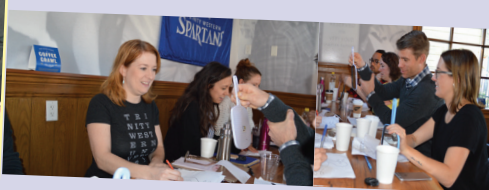
Some of our staff at the FASD & Trauma Workshop.