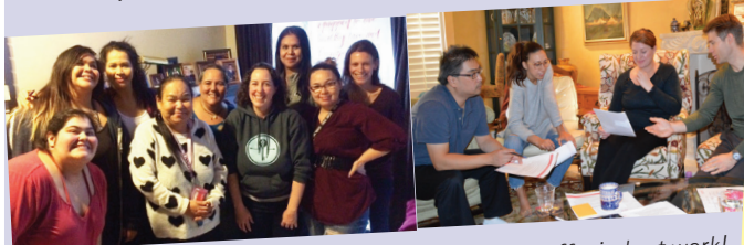
L: Community Advisory Committee; R: Some staff minds at work!

Our board, staff, and Community Advisory Committee have been hard at work on our a new 3-year Strategic Plan, equipping Inner Hope for the future!