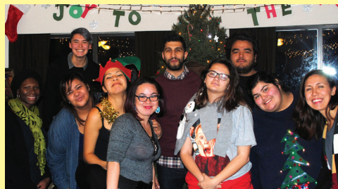
Last year's Post-Secondary Christmas Party at The House!