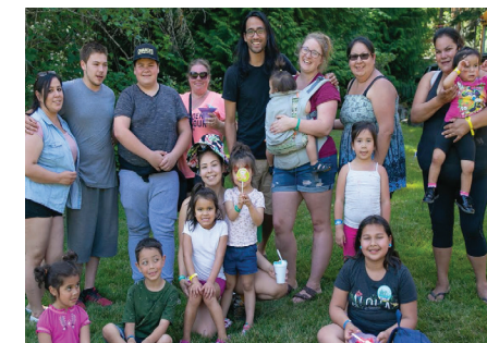
Community members enjoying Qwanoes

We just had a fantastic weekend at Qwanoes Family Camp with 25 community members! Praise the Lord!