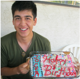
Continued doing life with youth through The House, Boundless and Reality Church.