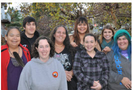
May: Formed our Community Advisory Committee, consisting of youth, young adults, and parents.