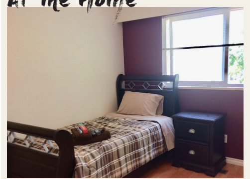
A room ready for our new summer resident

The "Shindig Hotenanny Extravaganza" was an awesome success. In July, we were thrilled to have 33 community members show up for a day of games, hot dogs and fun. Everyone loved the time spent together visiting in the sun.