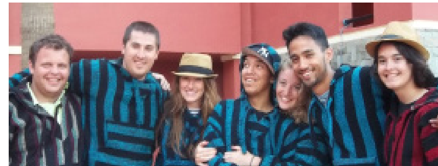
Mexico Service Trip 2011