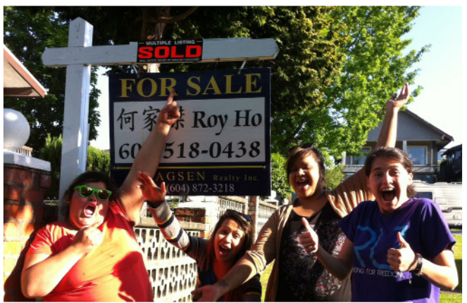
A SECOND HOME FOR INNER HOPE!

This past month, Inner Hope has been blessed with a second house aimed to provide a more private, family style home for youth needing permanent housing! Given the growth of the organization, much of The House is being used as community space, leaving House Parents with less privacy and time to focus on providing a home for youth needing stable housing.